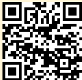
Scan to Download